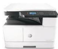
HP LaserJet MFP M42625dn