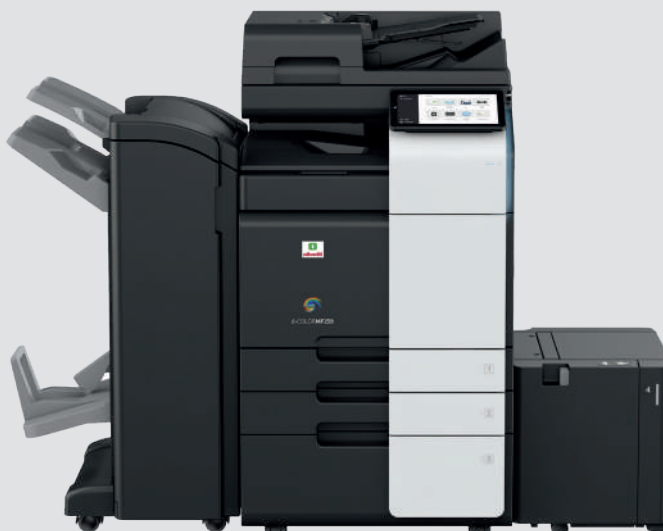
d-Color MF309 with DF-714+PC-416+LU-302+RU-513+FS-536SD