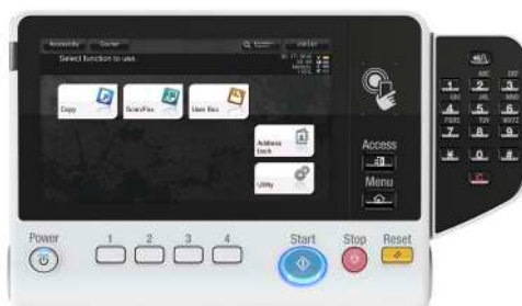
Innovative 7" Multi-touch Display Panel with NFC authentication area and optional Keypad (KP-101)