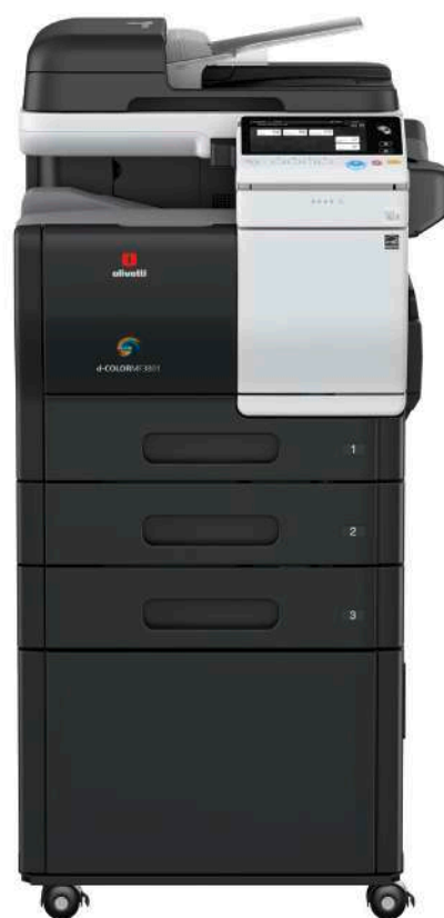
Configuration with 2 optional Paper Drawers and Copy Desk