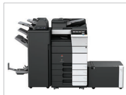
Configuration with SF-537SD Finisher, PI-507 Post-Insertor, RU-513 Connection Unit, PC-215 Drawers, LU-207 Side Drawer