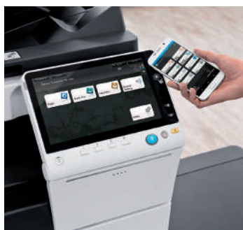
New 10.1" Touch-screen and NFC Authentication Area