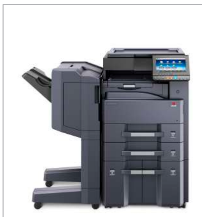
d-Copia 3201MF (or d-Copia 4001MF) + Platen Cover (E) + PF-810 + DF-7120 + AK-740