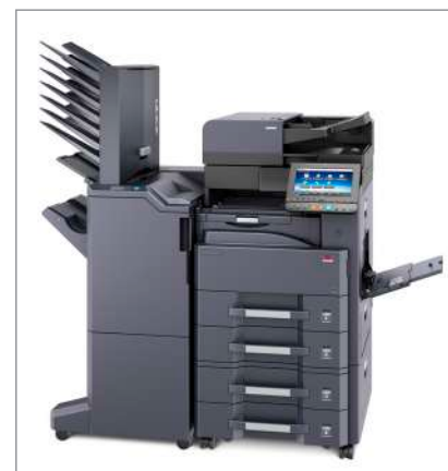
d-Copia 3201MF (or d-Copia 4001MF) + DP-7110 + PF-791 + DF-7110 + AK-740 + MT-730(B)