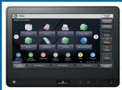
New 9" touchscreen