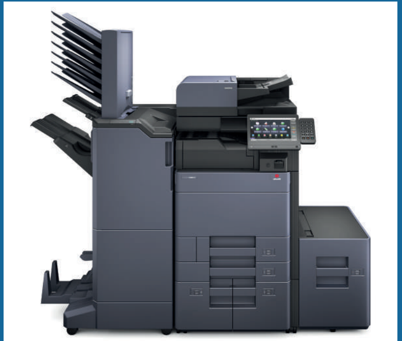
d-Copia 6000MF with DP-7110+PF-7110+PF-7120+DF-7110+BF-730+MT-730